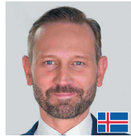
EINAR THORSTEINSSON Mayor REYKJAVIK