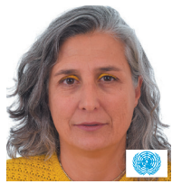
ANACLAUDIA ROSSBACH UN Under-Secretary-General and Executive Director UN-HABITAT