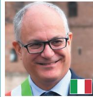
ROBERTO GUALTIERI Mayor of Rome CITY OF ROME