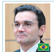
CELSO SABINO Minister of Tourism MINISTRY OF TOURISM OF BRAZIL