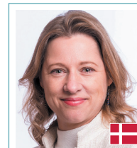
SOPHIE HÆSTORP ANDERSEN Minister for Social Affairs and Housing DENMARK