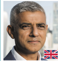
SADIQ KHAN Mayor LONDON