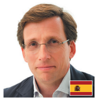
JOSE LUIS MARTINEZ ALMEIDA Mayor MADRID