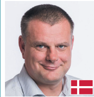
LARS WEISS Lord Mayor COPENHAGUE