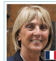
VALÉRIE LÉTARD Housing Minister FRANCE