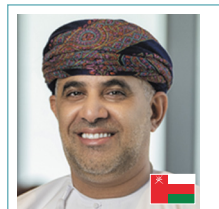
KHALFAN AL SHUEILI Minister of Housing and Urban Planning OMAN