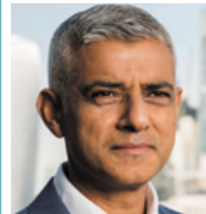
SADIQ KHAN Mayor LONDON