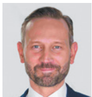
EINAR THORSTEINSSON Mayor REYKJAVIK