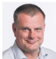
LARS WEISS Lord Mayor COPENHAGUE