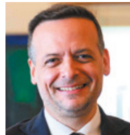
HARIS DOUKAS Mayor CITY OF ATHENS