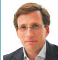
JOSE LUIS MARTINEZ ALMEIDA Mayor MADRID